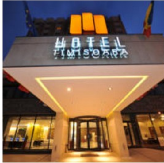
Hotel Timisoara 4*