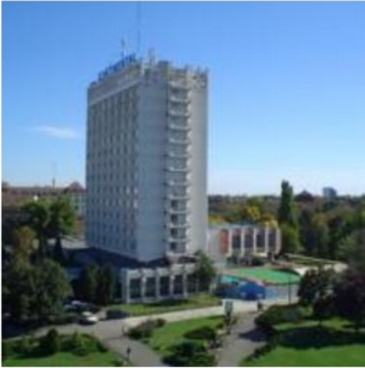
Hotel Continental Timisoara 4*